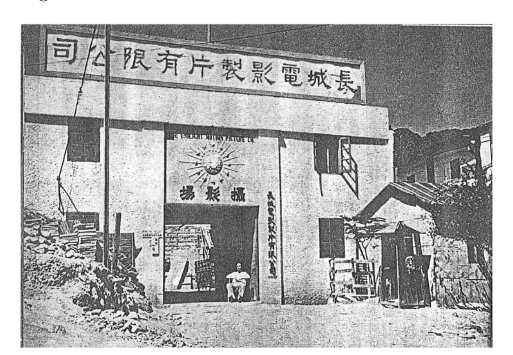
Figure 1. Great Wall Productions from Changcheng huabao 11 (1951).

Grasshopper and the Ant was the second animated feature film the Wan Brothers tried in vain to make in Republican Shanghai (Li 1951; "Ji Tieshan" 1940, 2). Their fascination with it was understandable, because the four Wan Brothers had already made an animated short with the same title The Grasshopper and the Ant as early as 1932 (Fu 2012, 4). In his memoir, Wan Laiming recalls this film as The World of Insects, which was an allegory for Japan's invasion of China. The film script was originally written by Zhou Yibai (1900– 1977), who later also came to Hong Kong and worked as a scriptwriter for Yonghua in 1947 (Wan 1986, 92). Excited about the possible fruition of their second animated feature film, the two Wan Brothers soon finished the first draft of the drawings, parts of which were published in The Great Wall Pictorial in 1951. The film is about two groups of insects: good and diligent bees pitted against lazy grasshoppers who try to exploit and take advantage of the bees. A human boy named Xiaoniu/Little Ox sides with the bees and helps them in their final battle against the grasshoppers and their allies (Figure 2) (Li 1951). Obviously, the grasshoppers allude to the Japanese while the bees symbolize the hard-working Chinese during the war.