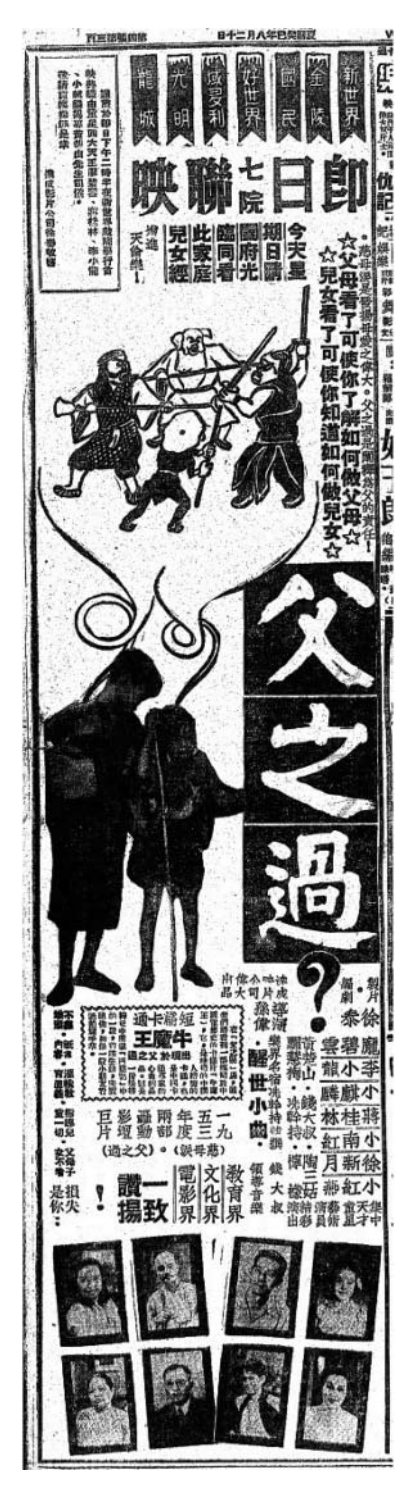
Figure 6. The advertisement poster for Blame It on Father from Huaqiao ribao (28 September 1953).