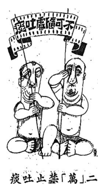
Figure 4. The Wan Brothers advertising their animated short 'No Spitting' from Changcheng huabao 10 (1951).

Insects into a color film, but they did not carry it out at all during their stay in Hong Kong. Otherwise, The World of Insects would have become a very important milestone in the history of Chinese animation. Similar to what they did prior to making Princess Iron Fan, the Wan Brothers only made a few animated shorts for educational purposes. A report from The Great Wall Pictorial shows that the Wan Brothers did make an animated film short entitled Jinzhi tutan/No Spitting for hygienic education in Hong Kong (Figure 4). This animated short was released in more than 20 theaters in Hong Kong Island and Kowloon ("Er Wan" 1951). It was probably the only animated film short they made during their stay in postwar Hong Kong.