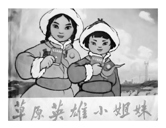
Figure 3 Heroic Little Sisters of the Grassland (picture book version), 1970, with animals marginalized to the extent of hardly being visible.

ing the Cultural Revolution.<sup>28</sup> As the film traveled into the depth of the Cultural Revolution, the biological animals featured in it continued to disappear radically. In November 1970, the Shanghai People's Press published a picture book directly adapted from the animated film. Also entitled Heroic Little Sisters of the Grassland , this picture book had the same plot as the animated film. However, in the picture book the role of Chairman Mao becomes more prominent and the emphasis on class struggle is intensified. The sisters' father becomes an oppressed shepherd liberated by Mao. The party secretary also stages "speaking bitterness" campaigns to publically criticize reactionary herd owners. The two sisters are portrayed as little Red Guards who wear Mao badges and read Mao's little red books.<sup>29</sup> As Mao, revolution, and class struggle take a more prominent role, the position of animals in the picture book is pushed into the far background and becomes almost invisible in the story, as visualized by the cover picture above (fig. 3).