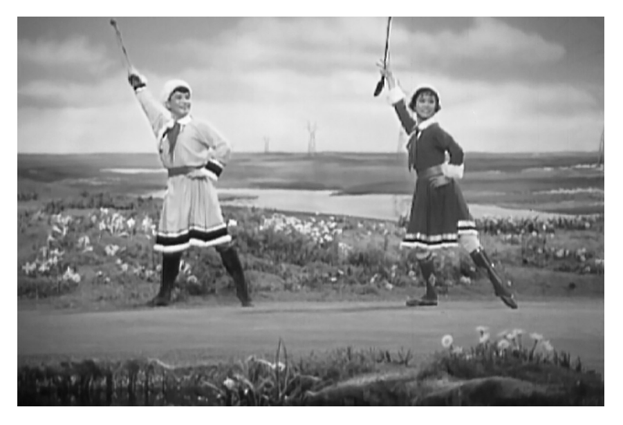
Figure 4 Sons and Daughters of the Grassland, 1975, with animals now completely absent.

critical moment, the People's Liberation Army soldiers appear in time and save the two children.<sup>30</sup> As class struggles become the center of attention, the position of the sheep in this film is further marginalized. The animals' existence is only suggested metonymically by the children's sheep whips and suppositional body gestures (fig. 4). Also, the use of stage lighting further foregrounds human protagonists and pushes animals, if any, into darkness and invisibility.