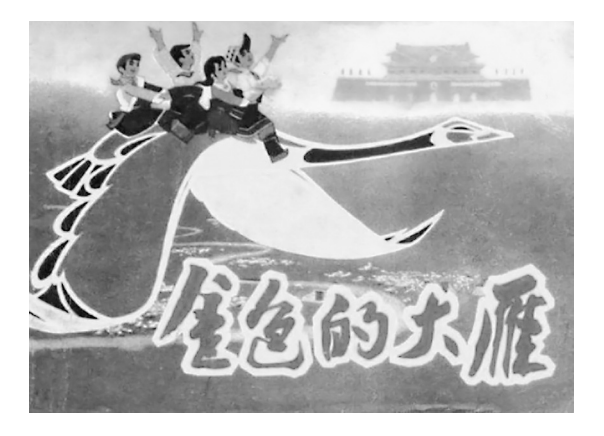
Figure 5 Tibetan children riding on the golden wild goose and flying to Tiananmen Square in The Golden Wild Goose, 1976.

In an uncanny way, the re/appearance of the magic wild goose, the return of the oppressed (à la Marx) and repressed (the animal within, or animalistic desire, à la Freud), triggered the demise of Mao and the collapse of the ideological system of the Cultural Revolution. The Tibetan children have the intention of wishing Chairman Mao a long life with the power of the magic snow lotus flower, but what is ironic is that just a few months after the fantastic bird reappeared on the silver screen, Chairman Mao died and the ideological system of the Cultural Revolution soon collapsed, as if the magic wild goose cast a spell on Tiananmen Square. This spell, as it were, is the magic power of the fantastic. The revolutionary rhetoric, though touted as rational during the Cultural Revolution, turned out to be a fantastic and even absurd scenario simply because it was too rational.