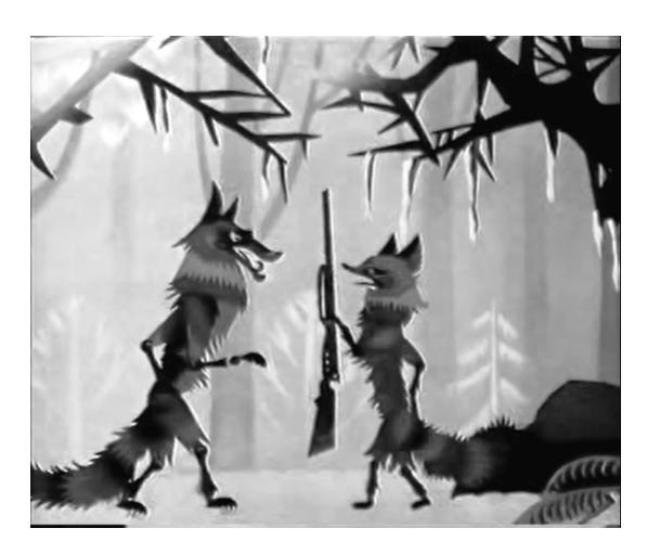
Figure 8 The fox (right) gives the usurped gun to the wolf and asks him to kidnap the young hunter in The Fox Hunts the Hunter , 1978.

and tries to kidnap and eat him (fig. 8). Although an old hunter intervenes and kills the fox, the young hunter is almost scared to death. The male voice-over of the film further confirms the symbolic death of the young hunter: "If a hunter loses his gun and trembles in front of beasts, he is already dead even if he still physically lives." The talking fox, though dead himself, still triumphs, because he symbolically kills the young hunter. By reversing the role of the hunter and the hunted, the fox reverses the power relation between humans and animals (in biological and representational terms) that began with the tragedy of sparrows in socialist China. The emphasis on the youthfulness of the powerless hunter is also a subversion of the socialist rhetoric, in which children and young people, manipulated by Mao, were the major forces in killing sparrows in the late 1950s. The Fox Hunts the Hunter is therefore a self-reflexive film about the relationship between animals and arts during the Cultural Revolution.