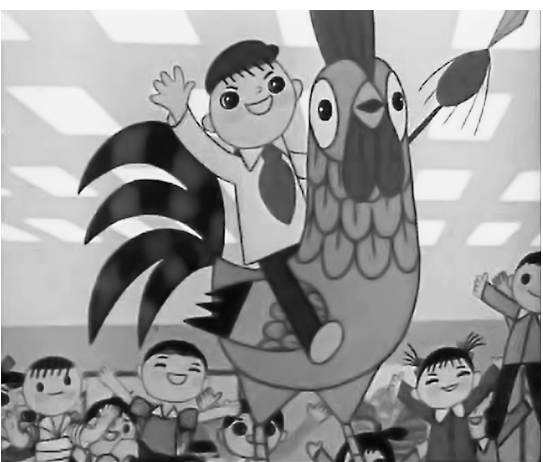
Figure 7 The aggrandized rooster in One Night at the Art Studio, 1978.

In fact, the metallic cudgel and cap allude to the notions of yi bangzi dasi (beat to death with a cudgel) and dai gaomao (put on a high cap), metaphors for the persecution of arts and artists during the Cultural Revolution. The machines' crossing out of animals in the beginning of the film marks the start of the Cultural Revolution characterized by the disappearance of animals, but it also paves the way for its own destruction because these animals come to life and resist the artistic coercion imposed on them. Artistic transformation is a self-generated process and "involution," or a revolution from within. In this battle against machines, the animals side with children. It is only after defeating the machines that the animals can obtain a niche in children's visual arts. The size of these animals is exaggerated, to the extent that the rooster even functions as a horse for children to ride on (fig. 7). In a similar vein, the size of the golden wild goose in The Golden Wild Goose is also exaggerated. The magnified size of these returned animals is a radical reassertion of their (over)presence and visual dominance after around ten years' absence on screen.