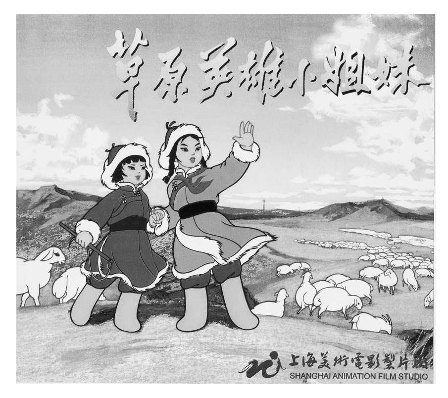
Figure 2 The domesticated lambs of the people's commune in Heroic Little Sisters of the Grassland , 1965.

( Early Spring , 1964). In addition, criticism of fantasy and fairytales was even more intensified in the mid-1960s. In November 1965, anthropomorphism, regarded as a way of defaming workers, peasants, soldiers, and children, was officially banned in the Shanghai Animation Film Studio.<sup>27</sup> The release of Heroic Little Sisters of the Grassland in December 1965 was a timely fit. Animated films produced thereafter were all characterized by the absence of anthropomorphic animals.