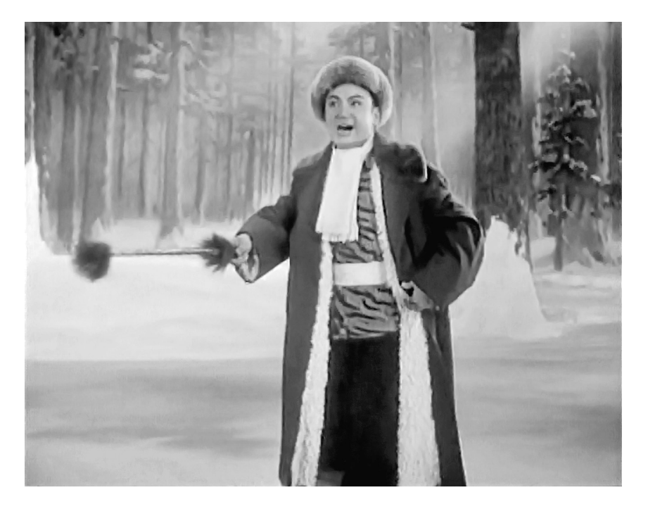
Figure 1 The horse-riding scene, absent a horse, in Taking Tiger Mountain by Strategy , 1969. Author's personal collection

be understood in an international context. In the so-called Third World during the Cold War era, there was an upsurging expulsion of Disney influence, which was conflated with Western cultural imperialism. What were excluded were anthropomorphism and medium plasticity that were regarded as the antithesis of classical mechanics and rationalism. For instance, Donald Duck, as well as other Disney animals, was regarded as a political messenger of capitalist ideology and cultural imperialism in Latin America in the 1970s. <sup>12</sup> However, the more direct influence on Jiang Qing might stem from Nadezhda Krupskaya, Soviet educator and the wife of Vladimir Lenin. Krupskya was hostile to fairytales and advocated that children should be given stories more centered on reality rather than fantasy. <sup>13</sup> There were heated attacks on fairytales in the Soviet Union during