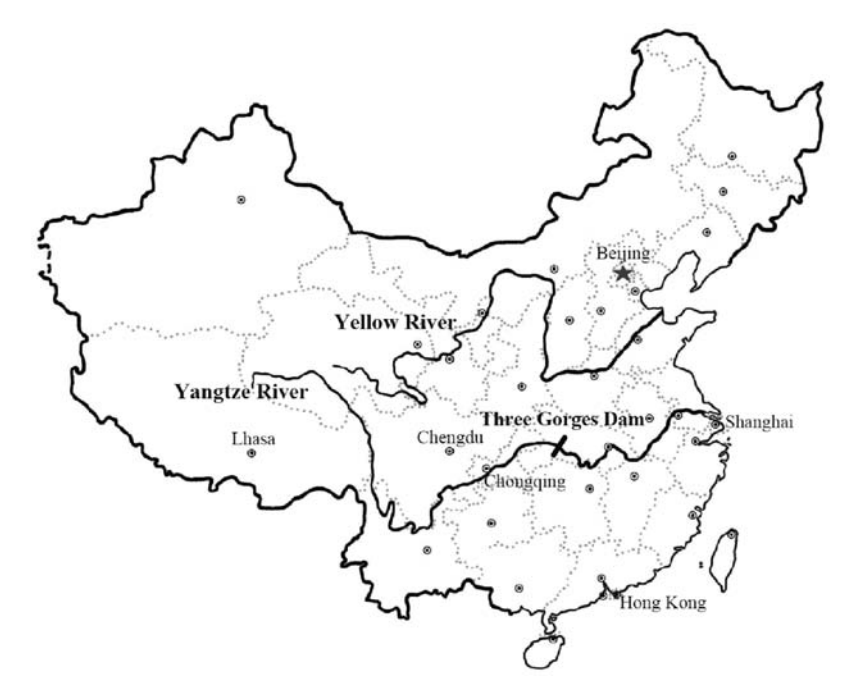
FIG. 1: The Yangtze River and the Three Gorges Dam site.

for interprovincial resettlement, because of its already large population (Padovani 2006, 101–2).