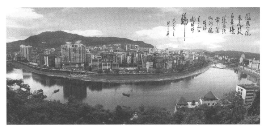
Figure 1: An aerial photograph of modern Tongzhou taken from the top of Cuiping Mountain. Phoenix Mountain appears in the background, with the city at its foot. It is said that Yuan Zhen took a boat downstream (from right to left in the picture) along the Zhou River and left Tongzhou on the ninth day of the Lunar New Year in 819. The inscription in the upper right corner is a poem by General Zhang Aiping (1910–2003), who was born in Dazhou. From Li Kaijie 2007.

first, by examining the local government's rehabilitation of the cultural hero Yuan Zhen within the context of the traditional Mountain-Climbing Festival; and second, by documenting the local government's geopolitical process as it undertakes the spatial and cultural renewal of modern Tongzhou. Ultimately, I argue that the sense of "tradition" represented by Yuan Zhen and the original Mountain-Climbing Festival is actually a creative invention of the government intended to serve the political and economic purposes of the modern present. The past, as Hue-Tam Ho Tai (2001: 3) writes, "is an eternally unfinished project, constantly under construction and constantly being revised." In the city of modern Tongzhou, the past is being constructed specifically through the figure of Yuan Zhen.