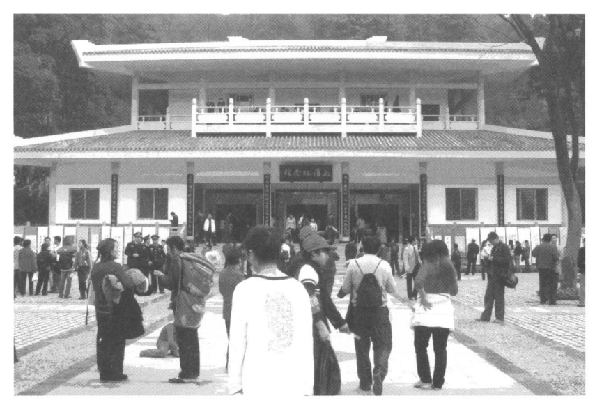
Figure 7: The Square and the Yuan Zhen Museum on Phoenix Mountain (Feb 26, 2007).

on the door columns, and upturned eaves, the memorial hall resembles a place of worship. To underscore its association with denggao (climbing high), the building was actually designed to visually mimic the Chinese character gao (fig. 7).