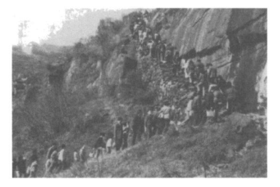
Figure 2: The Mountain-Climbing Festival in the late 1970s. From Li Kaijie 2007.

° C. K. Yang (1970: 294-295) distinguishes between two kinds of religion: diffused religion and institutional religion. In China, institutional religion is best represented by "major universal religions such as Buddhism and Taoism and by religious or sectarian societies," and diffused religion includes "ancestor worship, the worship of community deities, and the ethicopolitical cults."