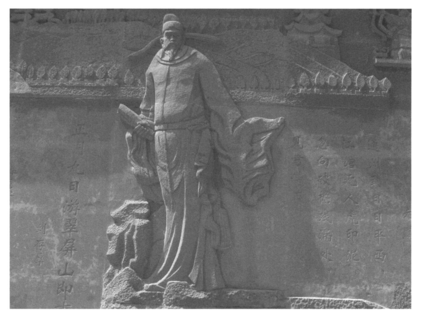
Figure 9: The relief carving of Yuan Zhen on the Pedestrian Street. Liu Cunhou's poem appears on the left side (Feb 25, 2007).

carving that appears on the wall of a residential building at the entrance to the Pedestrian Street in the city proper (fig. 9); his visual presence is thus shifted from the sacred mountain to the secular and commercial world below it. As an everyday spectacle for shoppers, Yuan Zhen becomes even more dissociated from the ritualistic meaning of the festival that is held at a specific place (mountain) and time (the ninth day of the Lunar New Year). The carving was commissioned by the government and a real estate company in 2006. Yuan Zhen's image appears at the center of this large rectangular carving. The book in his right hand symbolizes his poetic talents, and his attire alludes to his time as an official in Tongzhou. He is depicted with a very serious visage, as if he is deeply concerned about his people's lives. To Yuan Zhen's left is an inscription of his poem to Bai Juyi, and to his right is Liu Cunhou's poem "Climbing Cuiping Mountain on the