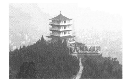
Figure 8: The Red Army Pavilion at the summit of Phoenix Mountain. The city of Tongzhou stretches out below it.

Although the memorial hall may look like the character gao, it is not the highest building on Phoenix Mountain, because it is situated only about halfway up the mountain. The highest building, located on top of the mountain, is the Red Army Pavilion, which was erected in 1982 to memorialize the 60,000 people who died fighting against the local GMD army led by Liu Cunhou (fig. 8). The pavilion was renovated in 2006 to celebrate the seventieth anniversary of the victory of the Long March as well as the first Yuanjiu Mountain-Climbing Festival. The Red Army Pavilion was designed to encourage local people to commemorate revolutionary martyrs, carry on their honorable tradition, and foster patriotism. With